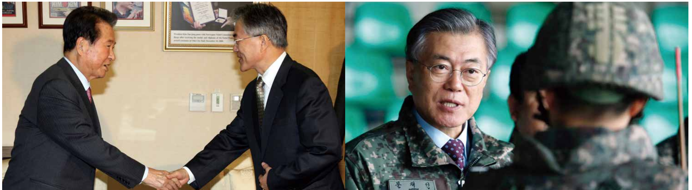
Cheong Wa Dae Chief of Staff Moon Jae-in Calling on Former President Kim Dae-jung

After working hard as Senior Secretary to the President for Civil Affairs for some time, he served as Chief of Staff for President Roh Moo-hyun until both left Cheong Wa Dae together. For the five years of the Participatory Government, Moon held fast to the position that any provocative acts detrimental to peace on the Korean Peninsula must not be tolerated. However, he also took the lead in paving the way for cooperation and peaceful exchanges between the two Koreas, working as the Chairperson of the Promotion Committee for the South-North Summit.