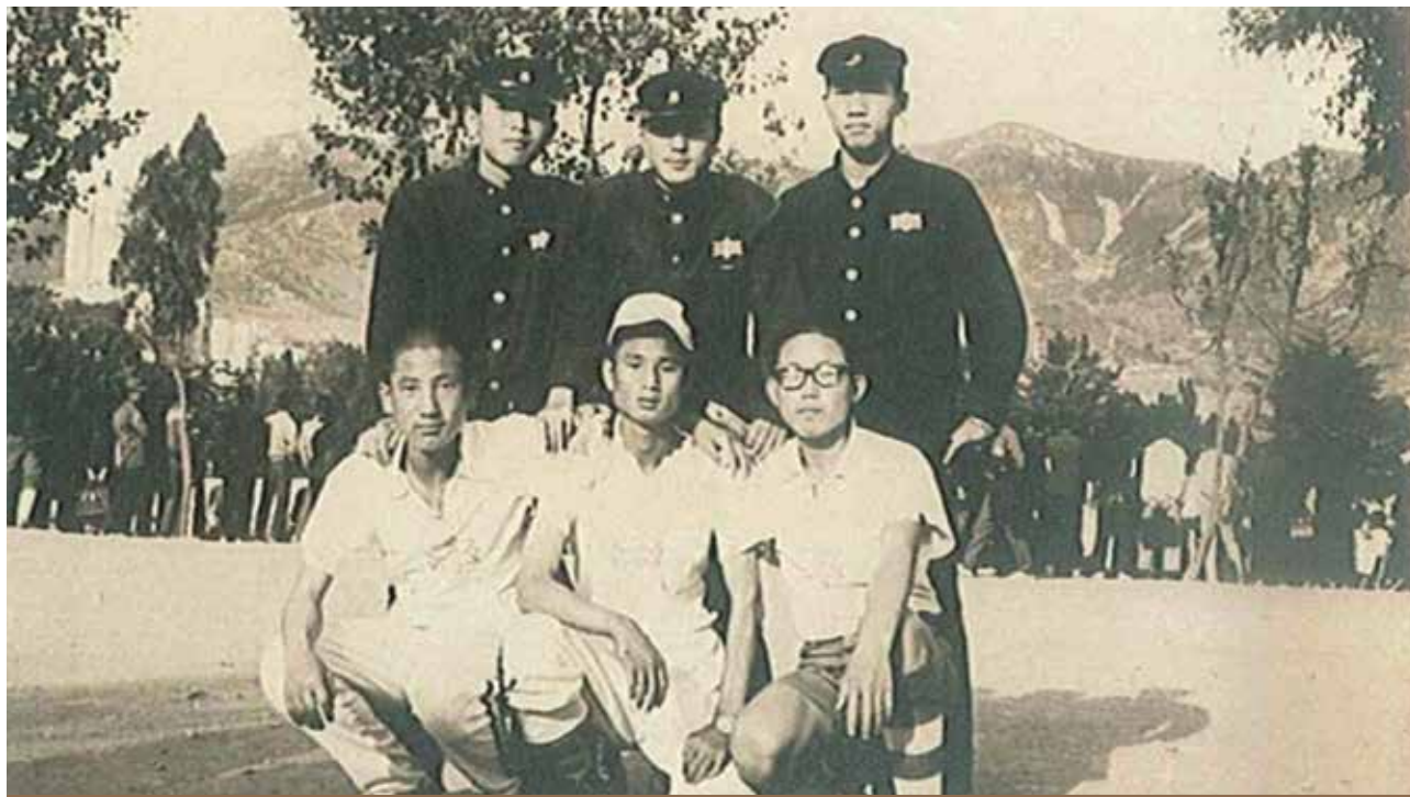
Moon Jae-in as a Gyeongnam High School Student (back row, middle)

Poverty prevented him from doing many things he wanted to do, yet it also helped him stand on his own feet. In addition, memories of his childhood spent in poverty taught him lifelong lessons and served as an opportunity to make up his mind not to turn away from those in need but to give them a helping hand.