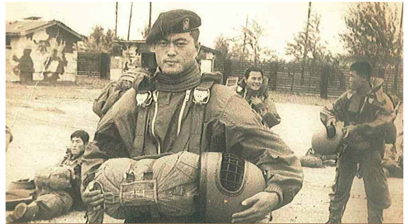
Moon Jae-in as a Member of the Special Forces

preparing for the bar exam. He wound up being arrested and detained. It was in a detention facility at a police station where he heard the news that he had passed the bar exam.