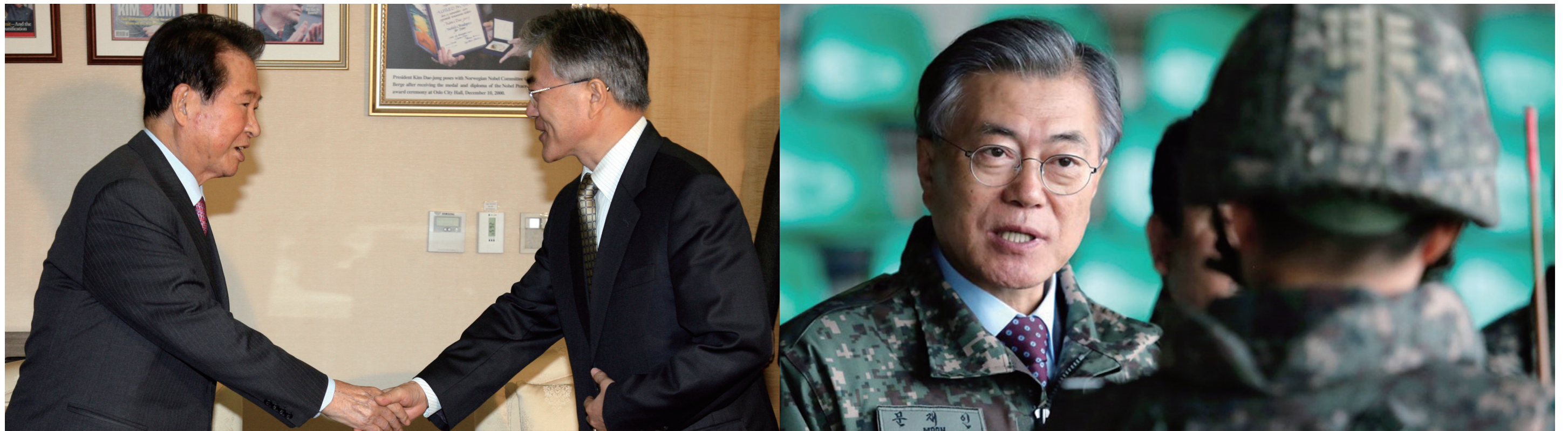
Cheong Wa Dae Chief of Staff Moon Jae-in Calling on Former President Kim Dae-jung

After working hard as Senior Secretary to the President for Civil Affairs for some time, he served as Chief of Staff for President Roh Moo-hyun until both left Cheong Wa Dae together. For the five years of the Participatory Government, Moon held fast to the position that any provocative acts detrimental to peace on the Korean Peninsula must not be tolerated. However, he also took the lead in paving the way for cooperation and peaceful exchanges between the two Koreas, working as the Chairperson of the Promotion Committee for the South-North Summit.