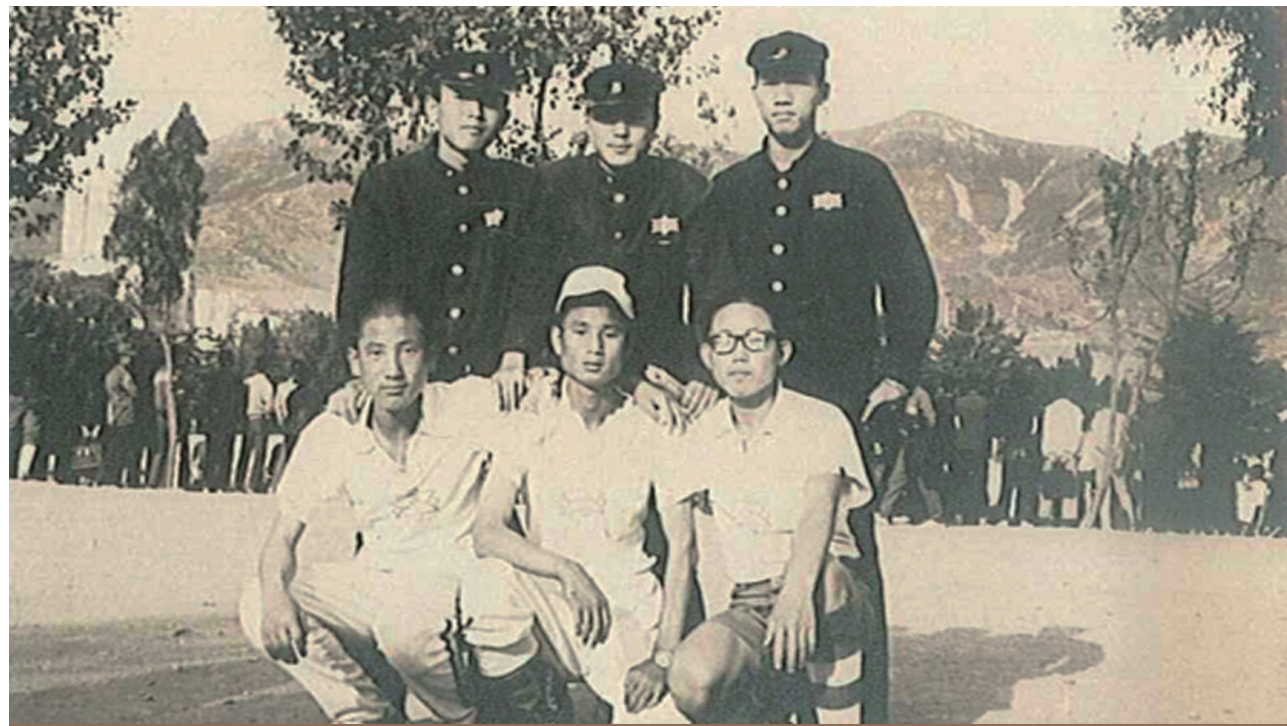
Moon Jae-in as a Gyeongnam High School Student (back row, middle)

Poverty prevented him from doing many things he wanted to do, yet it also helped him stand on his own feet. In addition, memories of his childhood spent in poverty taught him lifelong lessons and served as an opportunity to make up his mind not to turn away from those in need but to give them a helping hand.