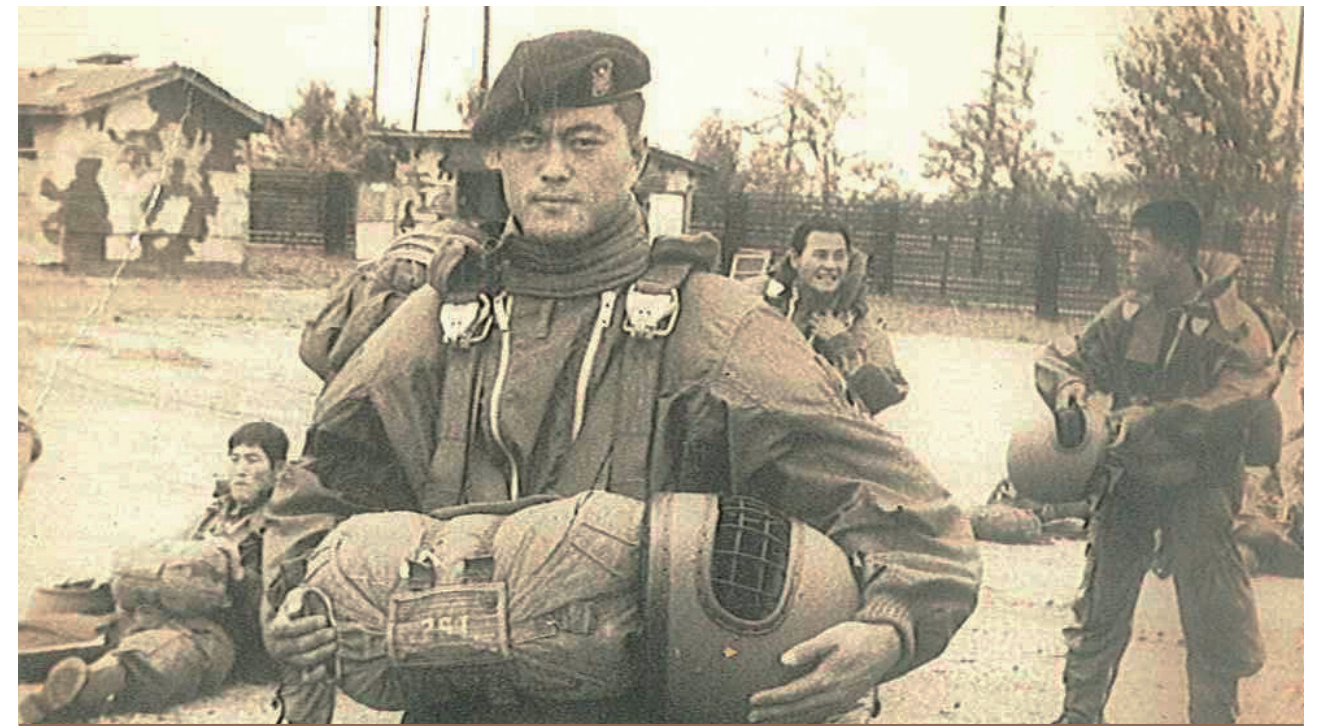
Moon Jae-in as a Member of the Special Forces

for the bar exam. He wound up being arrested and detained. It was in a detention facility at a police station where he heard the news that he had passed the bar exam.